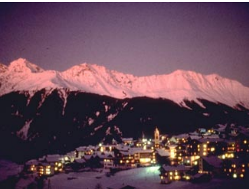
Above left Airboarding at Serfaus Above centre top Ski hut Masner at Serfaus Above centre bottom Relax at Serfaus Above right Serfaus Skifahrer Below left A night view of Serfaus Below right Fantastic vistas at Serfaus

right through to the end of April. Serfaus nestles on a plateau high above the Inn River valley, sheltered in a natural bowl which is allegedly Austria's biggest suntrap, enjoying over 2000 hrs of sunshine! You can ski all day too without covering the same run twice with wide slopes for beginners and some great black runs and powder. Kaunertal, where the British ski team trains on the glacier, is just down the road. Once you've had your exercise, Serfaus is undoubtedly the place for taking it easy and pampering yourself. Try the endless spa treatments at the 5-star Hotel Cervosa which can offer everything from foot reflexology to hay baths and Kaiserin Cissi baths (a posh jacuzzi with rose oil to tone your skin). It's definitely the resort for experiencing the finer things in life. Nearest airports Friedrichshafen & Innsbruck. ▶